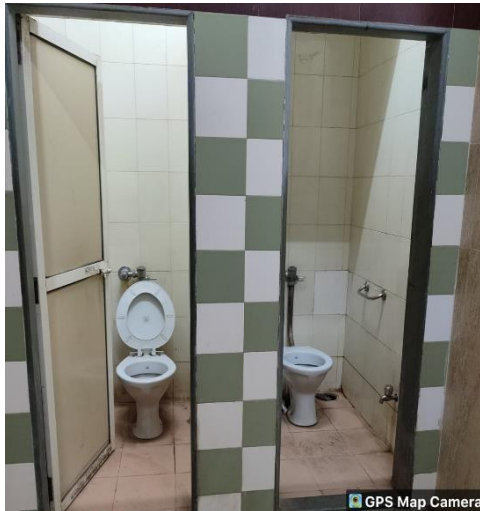
Washroom facility for Girl